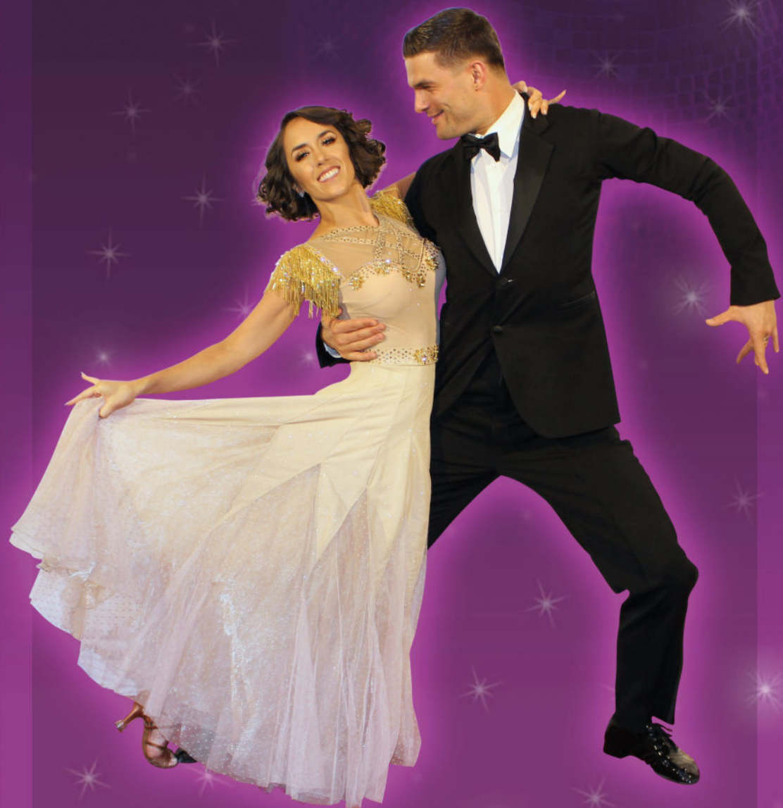
Aljaz Skorjanec & Janette Manrara