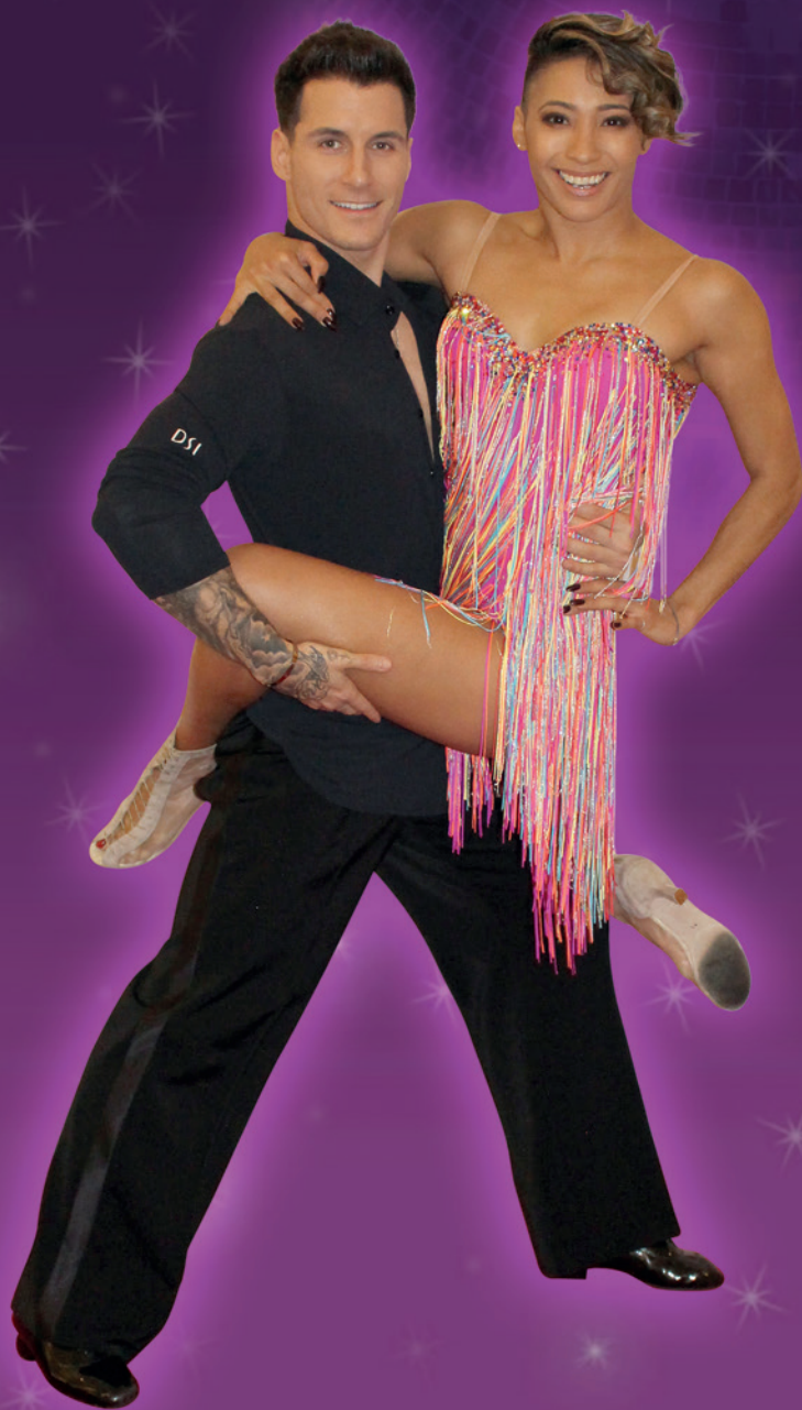
Gorka Marquez & Karen Hauer